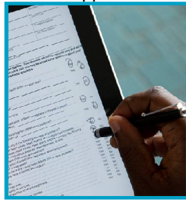
Computer in reception